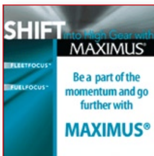
250 x 250