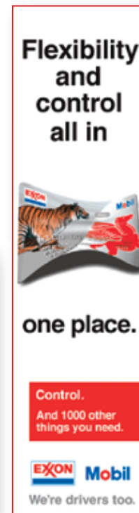
160 x 600