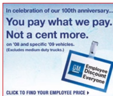
300 x 250