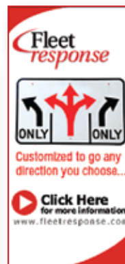
150 x 315